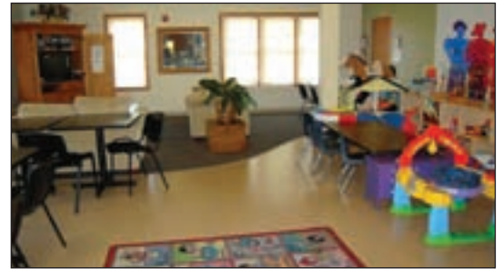
Sister House shared living room and play area