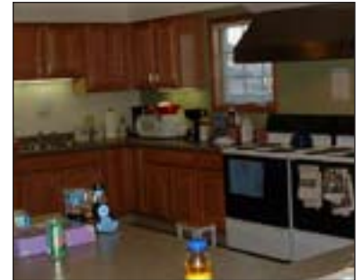
Sister House shared kitchen