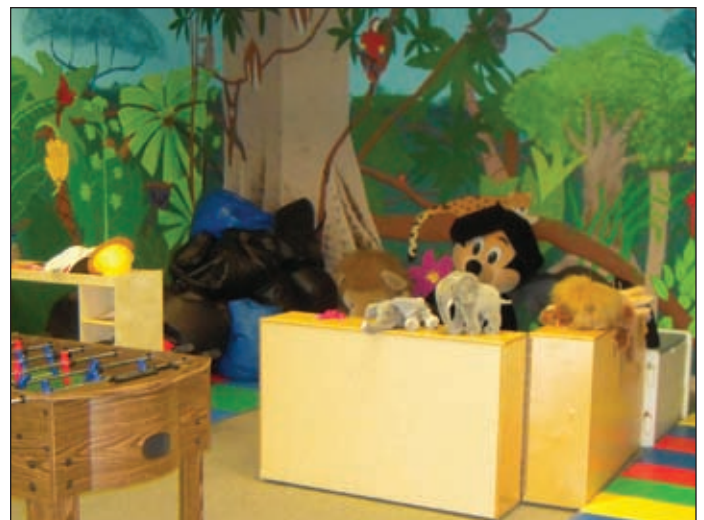
The "Jungle Room" at The Women's Center offers toys, games, ping-pong, computers, air hockey, foos ball and much more.