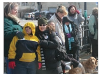
March 8 was International Women's Day. Supporters of The Women's Center met on the bridge on Barstow Street with signs, to call for an end to violence against women worldwide.