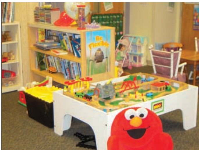
Childcare Room at The Women's Center.

On-site childcare is provided at no cost for children of clients being served at The Women's Center. The women who founded The Women's Center recognized the importance of on-site childcare. They believed that victims should not have to pay for support services, and that a lack of money for childcare should not be a barrier to women seeking services. Thanks to the generosity of donors we are able to continue the practice.