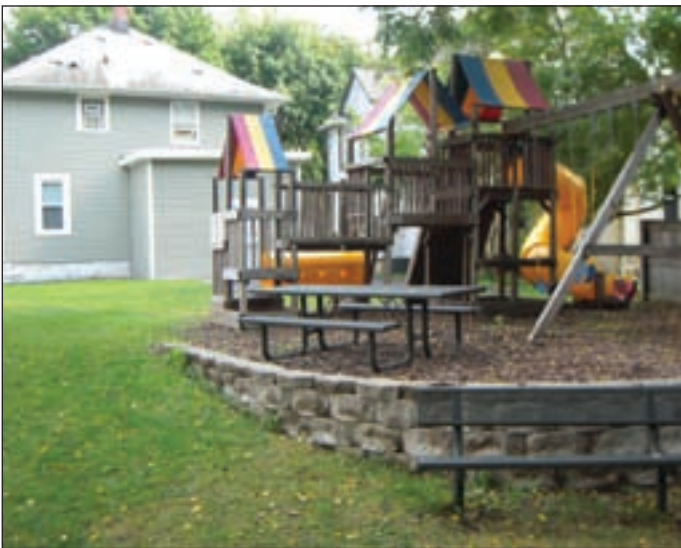
One of the four homes in the Transitional Living program

Transitional Living is a housing and counseling program designed to help women and their children transition from violent relationships to peaceful independence. The Women's Center operates four homes for large families and five apartments for single women and women with one or two children.